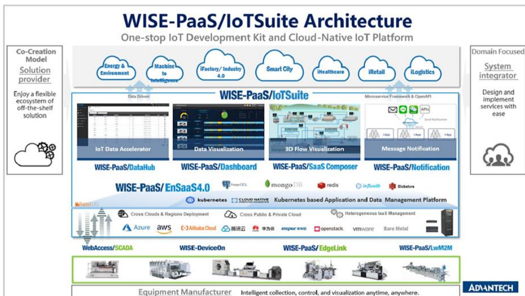
The WISE-PaaS Platform Architecture

The WISE-PaaS platform is an industrial-grade IoT integration service platform, offering various application development environments, including data processing, analysis, and management. Its primary objective is to seamlessly integrate IoT environments from the device end to the analysis end, all under a single management platform. With the assistance of the Advantech team, our local WISE-PaaS platform has successfully implemented the TwinSpace architecture. This architecture efficiently divides different teams into multiple tenants, enabling differentiation and effective management of service usage for each team.